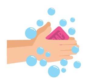
97% of consumers failed to wash their hands properly when preparing a meal.* *According to a 2018 study, U.S. Department of Agriculture